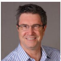
JOHN HUNTINGTON MCGREW REAL ESTATE

A little piece of the country in this 2 1/2 story country home. The home offers hickory kitchen cabinets with soft close hinges. Stainless steel Refrigerator & Dishwasher, plus a gas range. Luxury Vinyl Flooring on the main level and new carport upstairs. A full walk-up basement with a high efficient HVAC system. An oversized [...]