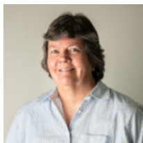
LAURA SMYSOR MCGREW REAL ESTATE

Completely updated home on beautiful, large lot. Fenced backyard with fire pit and newly redone deck. Low traffic street. New exterior paint. New interior paint in most rooms. Two large bedrooms on main level. 3rd bedroom in basement with it's own bath. Remodeled baths. New windows. New kitchen sink and downdraft cooktop. New carpet lower [...]