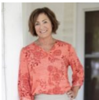
KARYN DAVIS MCGREW REAL ESTATE

Experience the convenience of main floor living, complemented by two additional bedrooms and a full bath on the upper level. The full basement features an office/den/hobby room, a spacious family room, and ample storage, complete with an extra washer/dryer hookup. This cherished and well-maintained home boasts numerous updates including a brand-new roof! The stunning curb [...]