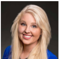
EMILY WILLIS STEWART MCGREW REAL ESTATE

Welcome to Fairfield Farms. Four bedroom townhome with a safer room. Large kitchen island. Granite countertops throughout. HOA is $800 a year and covers lawn care and snow removal of 2" or more. Room measurements are approximate.