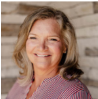
CHERI DRAKE MCGREW REAL ESTATE

Discover your ideal retirement lifestyle in this charming 55+ townhome located within the tranquil Brandon Woods Continuing Care Retirement Community. This inviting property is packed with amenities designed for your convenience and comfort, including access to a well-equipped gym, a soothing saltwater pool, and delicious continental breakfast and lunch options at the nearby dining facility. [...]