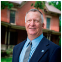
THOMAS HOWE MCGREW REAL ESTATE

Sweet cottage in the highly desirable University Place neighborhood, newly remodeled and freshened up, with all new systems, and ready for it's lucky new owner. Enjoy the comfortable setting, relax on the back deck, or entertain a few friends utilizing the lovely new kitchen. This delightful and warm home is close to the University, to [...]