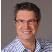
JOHN HUNTINGTON MCGREW REAL ESTATE

Both units are well kept with hardwood floors in the living & bedrooms. One car garage with washer/dryer hookups & fenced back yards.