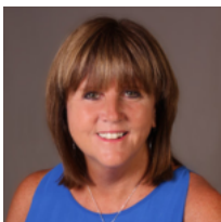
JANET BREITHAUPT MCGREW REAL ESTATE

Back on the market at no fault to seller! Sharp Bi-level nestled on a spacious corner lot surrounded by beautiful mature trees. This home offers a beautiful main level. The primary bedroom, along with two additional bedrooms, is located on the upper floor providing ample space for everyone. The generous kitchen, dining room, and living [...]