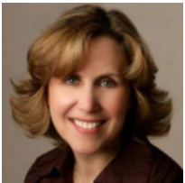
KIM CLEMENTS MCGREW REAL ESTATE

Wonderful home located in popular Potwin in Topeka. Cute 2 bedrooms, remodeled bath, living and kitchen all on one level. Eat in kitchen which overlooks the fenced backyard. Oversized two car garage is huge. 31x24! Imagine the possibilities with this space