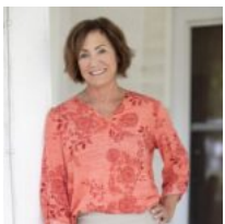
KARYN DAVIS MCGREW REAL ESTATE

Rent in style and comfort in this beautifully updated, extremely sharp, well maintained home. Plenty of room for all with 5 bedrooms and 4 baths. The gourmet eat-in kitchen leads to a screened-in porch that overlooks a fenced-in backyard with mature trees and access to the Lawrence Loop trail. Enjoy the high ceilings throughout, the [...]