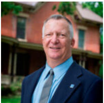
THOMAS HOWE MCGREW REAL ESTATE